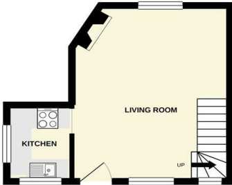
GROUND FLOOR 322 sq.ft. (29.9 sq.m.) approx.